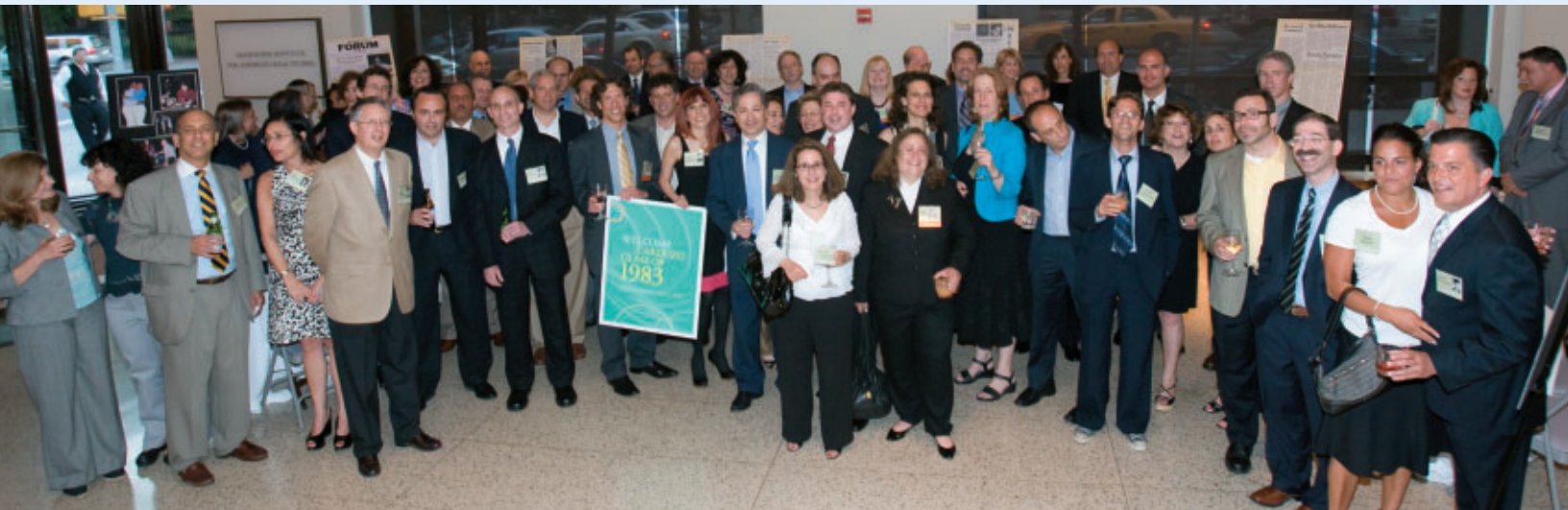
The class of 1983